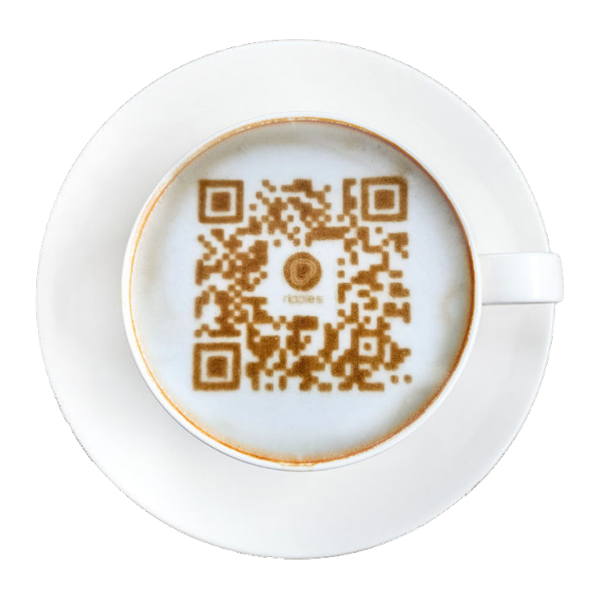
Need new pods? Scan to order and to see local currencies <a href="mailto:store.drinkripples.com">store.drinkripples.com</a>

The print capacity of each pod may vary according to the design type and size i.e - text, selfie, pictures, and graphics. The prices listed in this document are in USD and are subject to change without prior notice. Ripples reserves the right to modify prices, fees, or any other charges associated with the products/services listed herein at its sole discretion. Recommended beverages may vary by local regulations and standards.